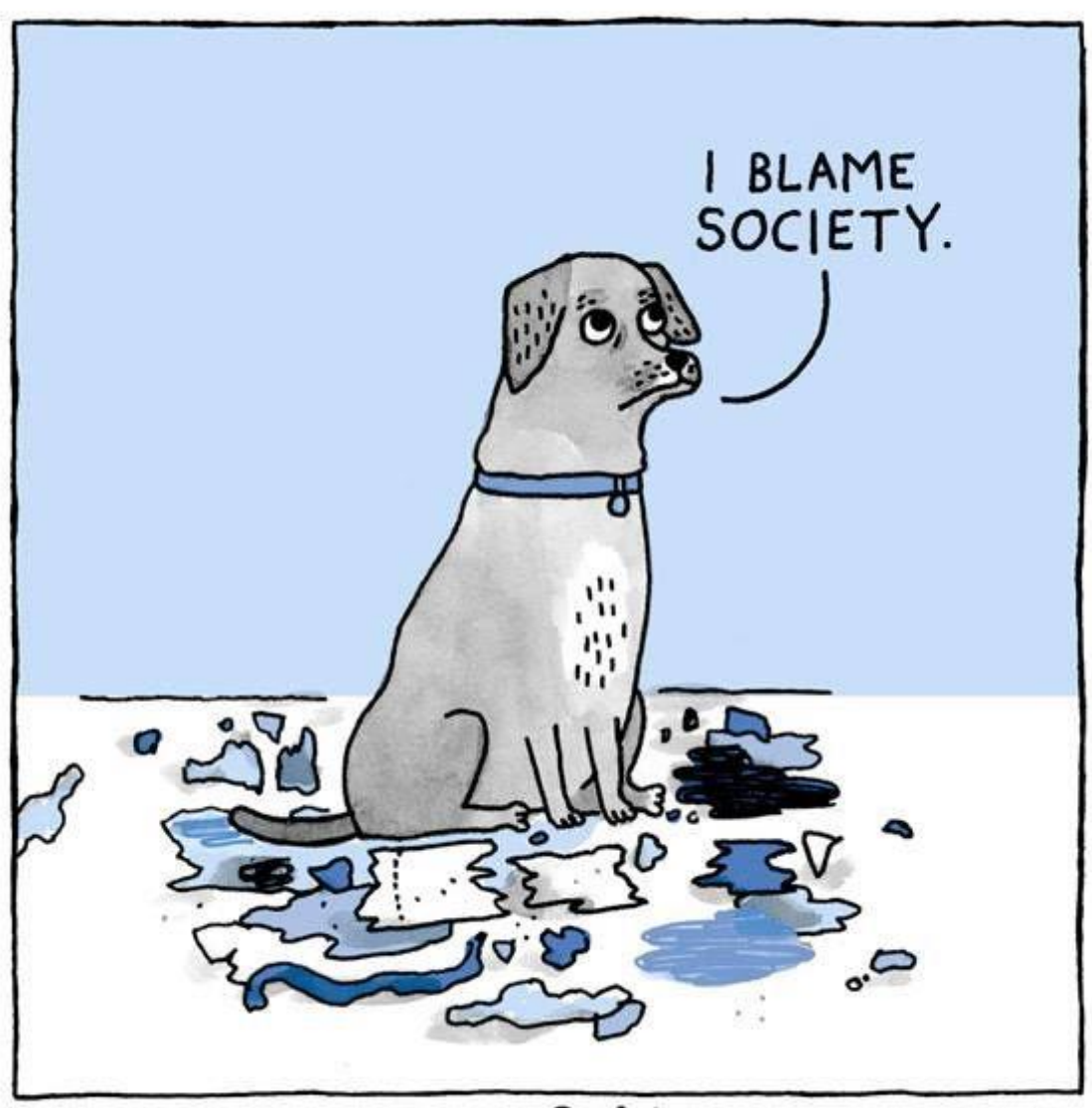
@ FOUR EYES / GEMMA CORRELL 2013

You are required to complete ALL of the activities in this transition pack for submission in the first lesson. The A Level in Sociology is a fun, applicable and challenging qualification. It will develop your analytical skills and vastly expand your knowledge of the way in which society functions. You will have six 50 minute lessons per week. It is also expected that students also complete five hours of independent study per week at home and during their independent study periods.